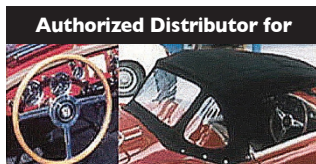
Authorized Distributor for

Log on to www.LBCarCo.com and see why we excel at what we do.