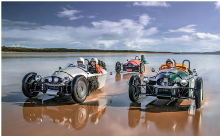
VIEW LAUNCH TRAILER

At the very heart of Super 3's personality is its driving character. It entices you to get behind the wheel and embark on journeys you never thought possible. Our own in-house teams have worked alongside industry engineering and design teams, along with our partners, have been