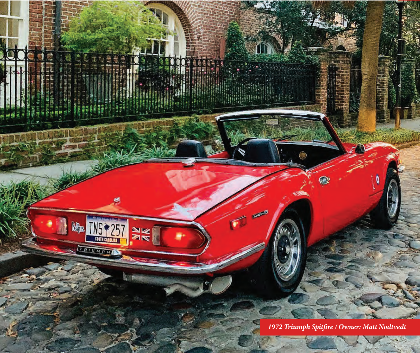
1972 Triumph Spitfire / Owner: Matt Nodtvedt