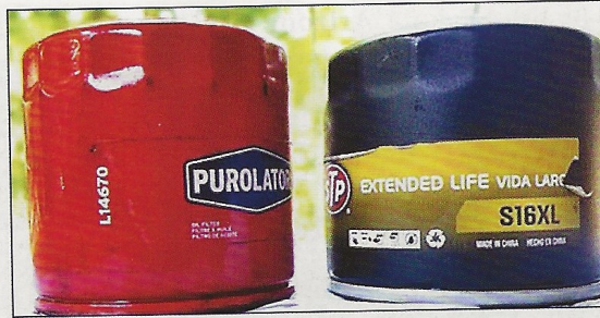
Hard to tell the height difference by sight.

A LERT! The AutoZone recommended oil filter for a 1979 MGB is STP16XL, but it will not work. I had been using the Purolator L14670 and went back to it. While the outside height of the STP 16XL is virtually the same as the Purolator L14670 (or PL14670, or even the PB14670), it does not reveal the depth from rim to the bottom.