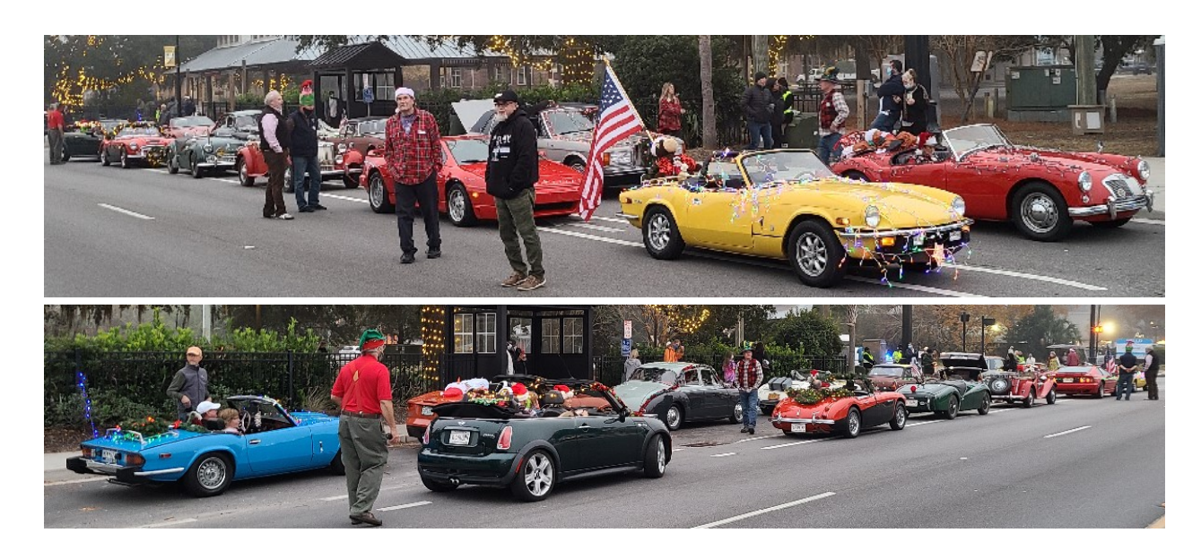
Waiting for sunset and the Mt Pleasant Christmas Parade to start