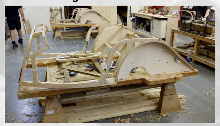
Irene's '66 Plus 4