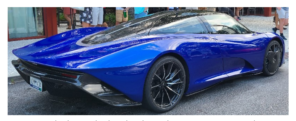
McLaren Speedtail—1035hp (310 hp electric), 0 to 186 in 13 seconds, 0 to 62 in 3 seconds, 250 mph top speed, 3 seater - driver in the middle $2.1 million starting price.