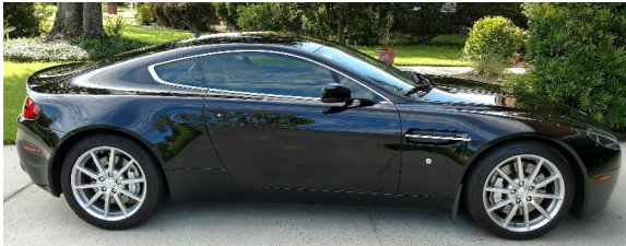
2007 Aston Martin Vantage V8 - 385hp, 19,800 miles

Wanted: TR6 Motor Looking for a rebuilt 1971 triumph TR6 motor, or close to that year. I live in Charleston area. Would prefer already done if possible? Call 909-856-1972 or