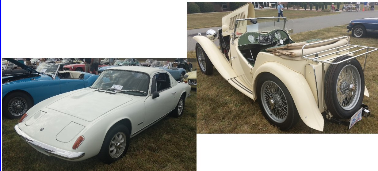
A couple more British cars at MG's on the Green