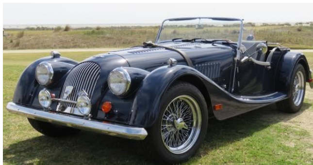
1998 Morgan Plus 8