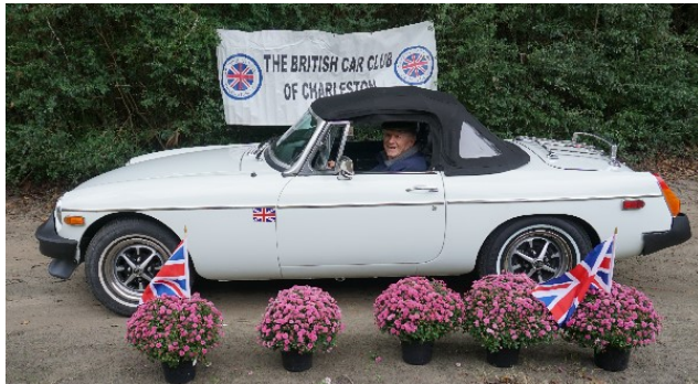
1977 MGB restored in 2015