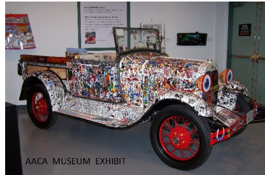
AACA MUSEUM EXHIBIT

Cars on Kiawah is a family event, bring the children and go to the Kids Display!