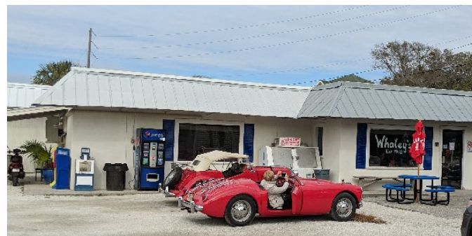
Lunch at Whaley's