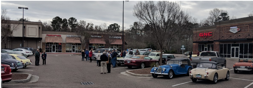
Meeting up at Publix