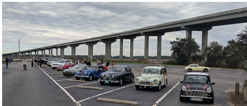
A stop at the Dawhoo Bridge Boat Ramp