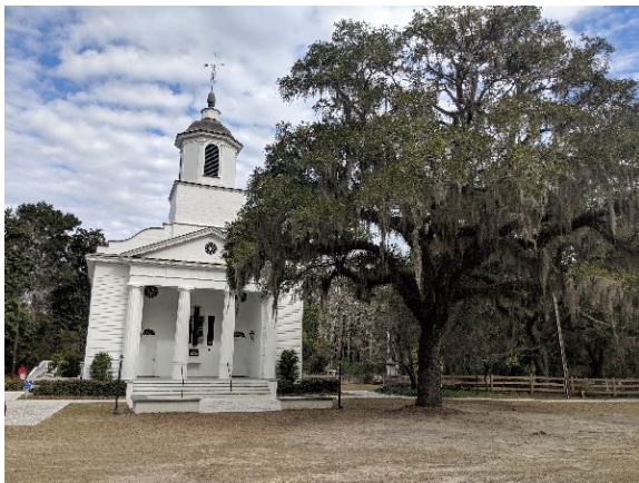
Presbyterian Church On Edisto