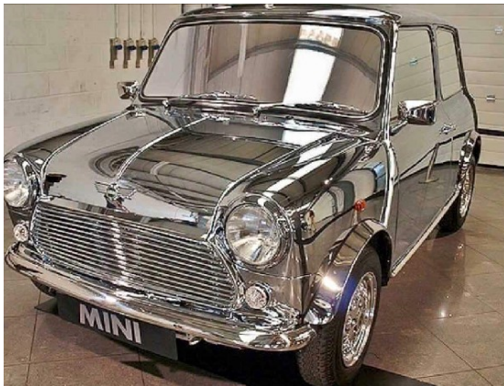
David Bowie's chrome Mini Cooper