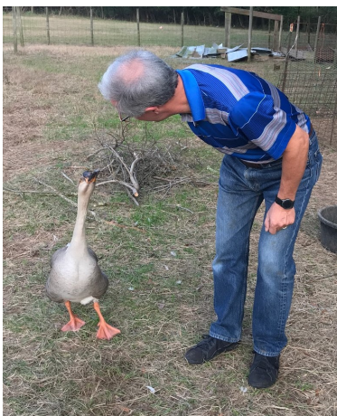
I've never befriended a goose but by the time we left, this guy was my best buddy!