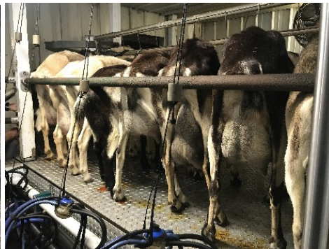
They line themselves up, ready to be milked