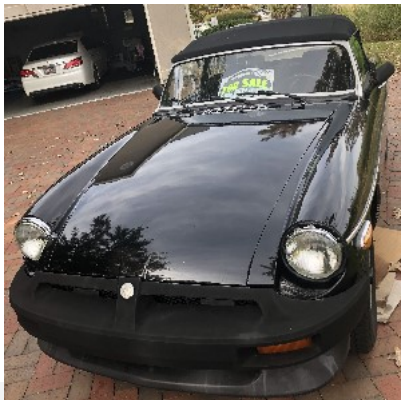
1980 MGB Limited