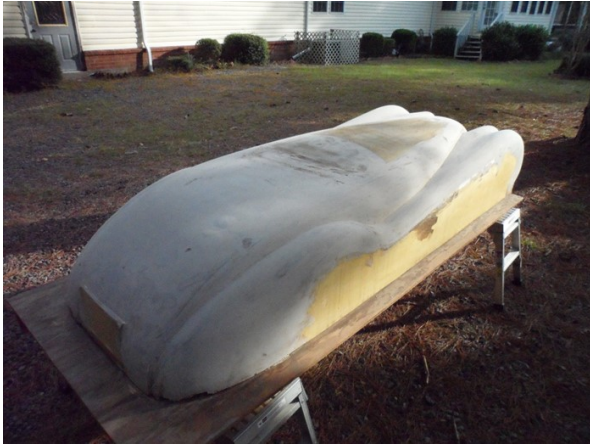
These are year old photos; some progress has been made since.