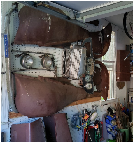
Parts hanging on the wall. The outer body parts are very solid and relatively straight.