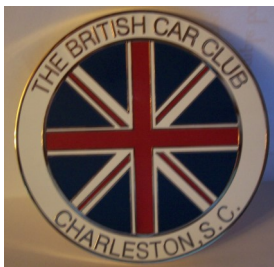
Only $30 for a club Grill Badge