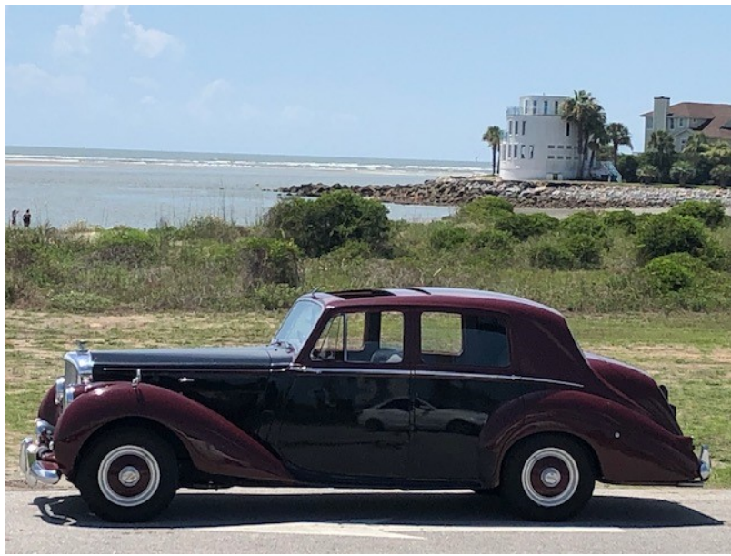
Millie Horton out for a drive on this beautiful day celebrating Bentley's 100 th anniversary.