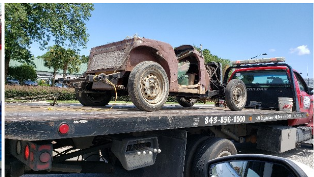
Transporting the car from the storage unit to the home garage.