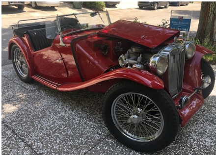
1948 MGTC, asking about $15,000. See the website for more

Wanted: TR6 Motor Looking for a rebuilt 1971 triumph TR6 motor, or close to that year. I live in Charleston area. Would prefer already done if possible? Call 909-856-1972 or email tjsautos@yahoo.com