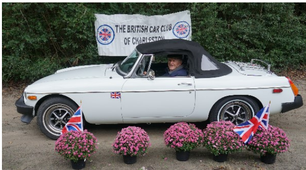
1977 MGB restored in 2015